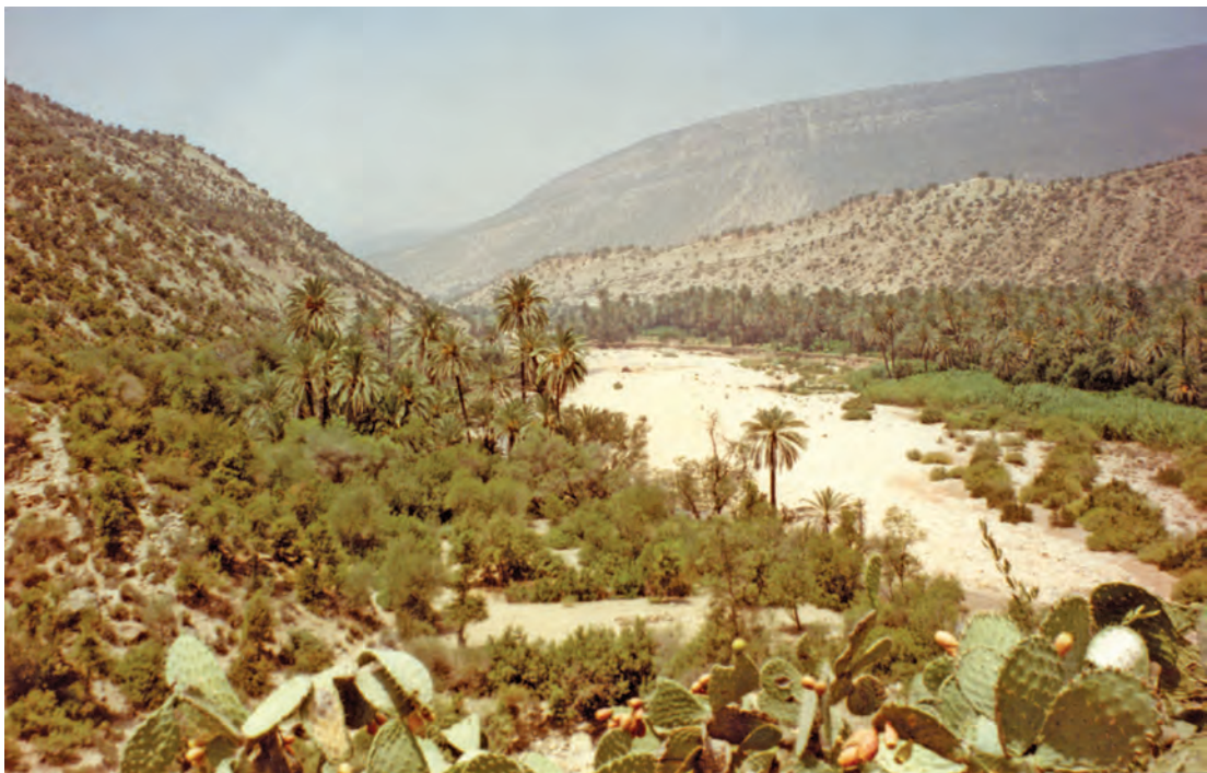
Photograph B for Question 4